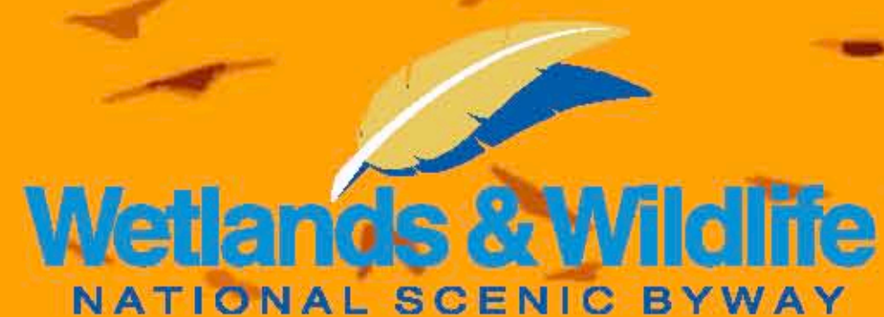
Cheyenne Bottoms Ted Lee Eubanks

But the Byway offers far more than beautiful wetlands and birds. Along your trek, you’ll see native stone buildings, underground tunnels, metal street art, WPA art and bridges, an operating flour mill, a stretch of the Santa Fe Trail, a raptor center, and more. So grab a Byway map, slip in the audioguide, and discover our extraordinary corner of the planet.